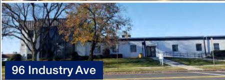
96 Industry Ave