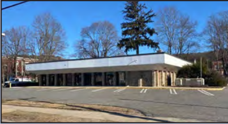
PALMER: For Sale or Lease. Freestanding 3,395 SF former bank building with 24 parking spaces. Ideal for retail, office, or medical. Located on the Route 32 intersection in Palmer center.