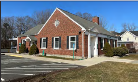
WILBRAHAM: For Lease. Free-Standing. 2,475 SF bank building on Main Street with 35 parking spaces. Retail, office, or medical.