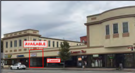
WESTFIELD: For Lease. 1,258 SF. In-Line. Located on Main Street near Park Square. High visibility and foot traffic. Co-tenants include Subway, Domino's, Wise Vapors & Liberty Tax.