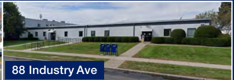
88 Industry Ave