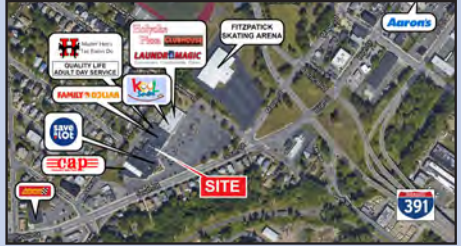
HOLYOKE: For Lease. 8,459 SF In-Line at South Street Plaza. Large central space right off of I-391. Co-tenants include Save-A-Lot, Master Heo's Tae Kwon Do, Family Dollar, & Kool Smiles.